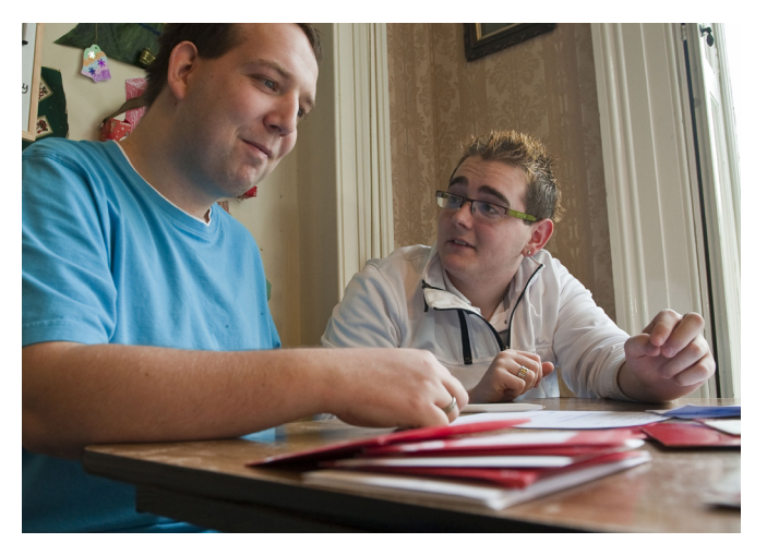
Once the immediate risks have been addressed and a clear plan is in place, the CHAT team will liaise with the community hubs who will then continue with the ongoing care plan as needed.

The CHAT team works to a positive behaviour support model to provide intensive support to people who are experiencing a deterioration in their mental health, or an increase in behaviours of concern and associated risk to self and others. The service will respond quickly and positively to assess the level of risk and put in place a plan of care to address the immediate concerns. Initially this would be for 72 hours, with additional support for a further two weeks.